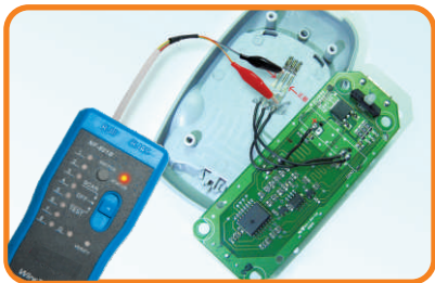
test positive and negative pole of DC electric level

Push DIP switch on emitter to position of “SCAN” , press function switchover button on emitter for 2 seconds, “STATUS” indicator will turn off and “VERIFY” indicator flashes, insert the crystal plug of crocodile clamp into RJ11, clamp the two ends of cable with crocodile clamps, in case that “STATUS” indicator lights up in red , it means the end clamped by red clamp is positive pole, in case that “STATUS” indicator lights up in green, it means the end clamped by red clamp is negative pole, electric level can be judged by brightness of the status indicators; the lighter the indicator, the higher the level is; the darker, the lower.